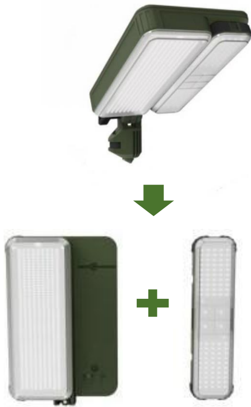
Portable/Multiple Combination Mode