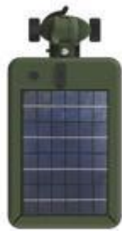
USB Charging / Solar Charging