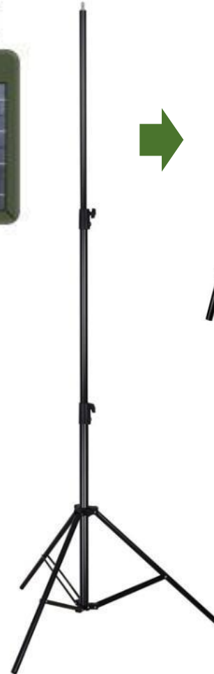
The tripod can be extended to 1.9m